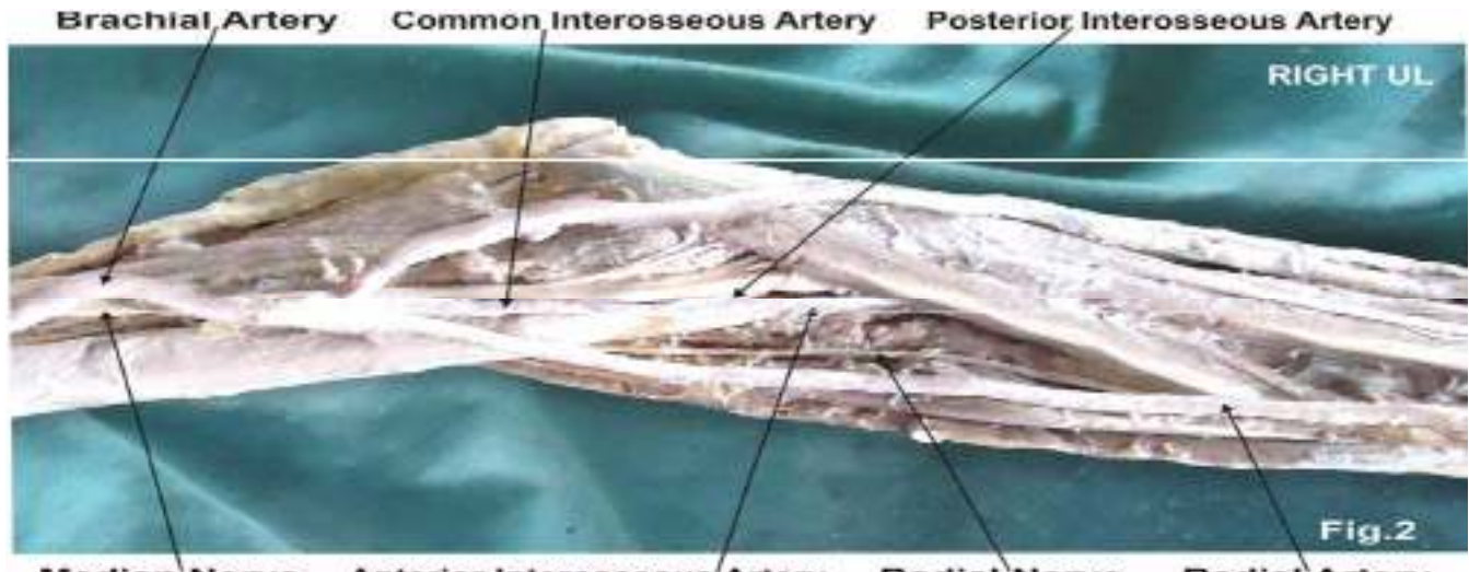
Figure 2: The photographic presentation of larger and superficial ulnar artery, smaller radial artery and unusual termination of the common interosseous artery into the anterior and posterior interosseous arteries in the cubital fossa.