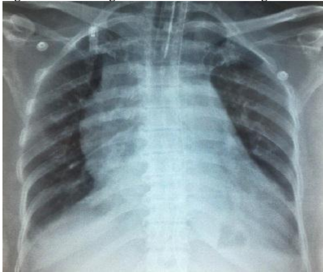
Fig 1. CXR showing mild mediastinal widening.