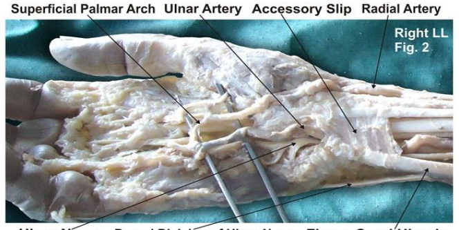
Ulnar Nerve Dorsal Division of Ulnar Nerve Flexor Carpi Ulnaris

Figure 2 showing the photographic presentation of variant small muscle belly of flexor carpi ulnaris crossing ulnar nerve, vessels and median nerve.