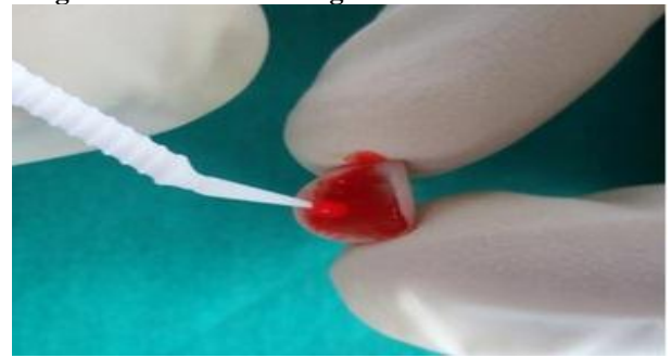
Figure 6. HF acid etching of inner side of laminate