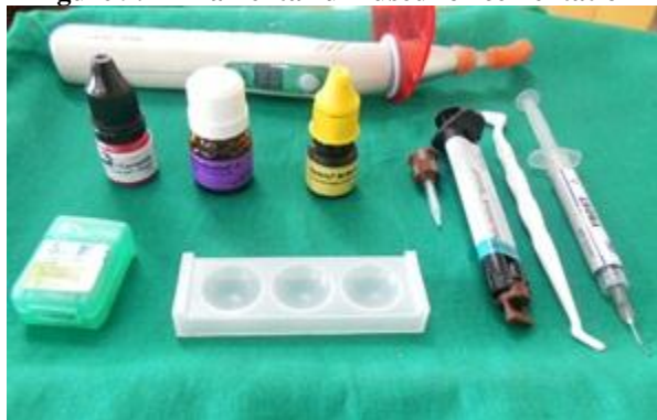
Figure 9. Armamentarium used for cementation