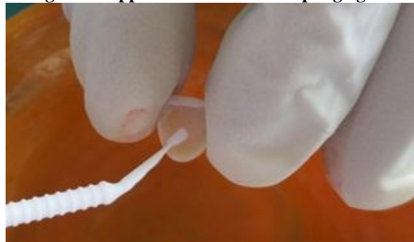
Figure 7. Application of silane coupling agent