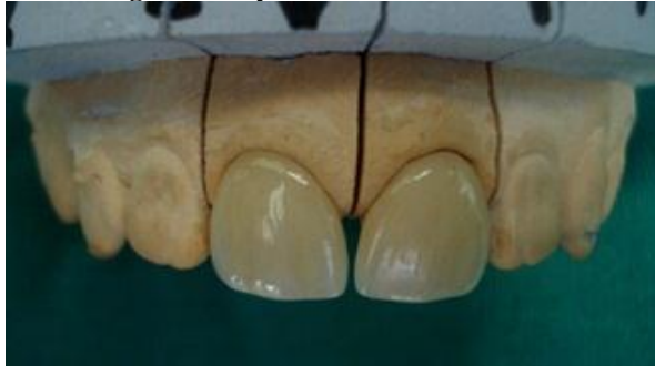
Figure 5. Try-in of veneers over cast