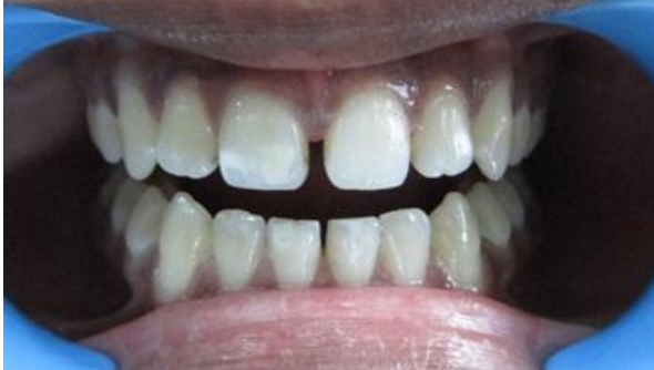
Figure 1. Pre-operative photograph