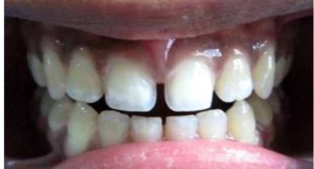
Figure 2. Tooth preparation for ceramic veneer