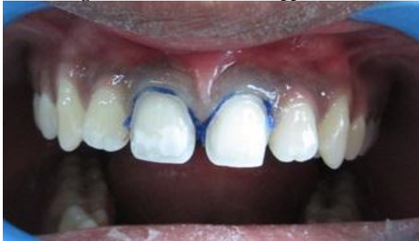
Figure 3. Retraction cord application