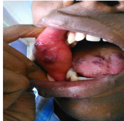
Figure 5. Resolution of mucosal lesions following sclerosant injection

needle, manual compression was given for 10 to 15 minutes over the lesion with sterile gauze. The patient was advised to take anti-inflammatory and analgesics and recalled after one month. In the second visit, the patient was reviewed with 50% reduction in the size of the lesion. In our case, the patient experienced transient severe pain postoperatively with minor complications. The patient was reviewed after one month and bimonthly interval, found the complete absence of the lesion and no evidence of recurrence.