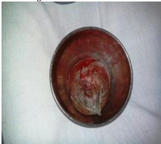
Figure 3. Ranula after excision