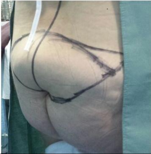
Figure 1. Extensive lumbosacral lipoma with a preoperative schema