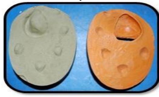
Figure 2. Photograph showing final impression was invested for wax pattern fabrication