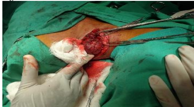
Fig 3. Per operative picture showing tumor in the neck region