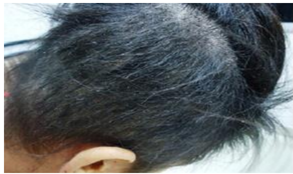
Figure 2. Clinical photograph of the scalp showing multiple broken hairs with nodular beaded thickening at irregular intervals.