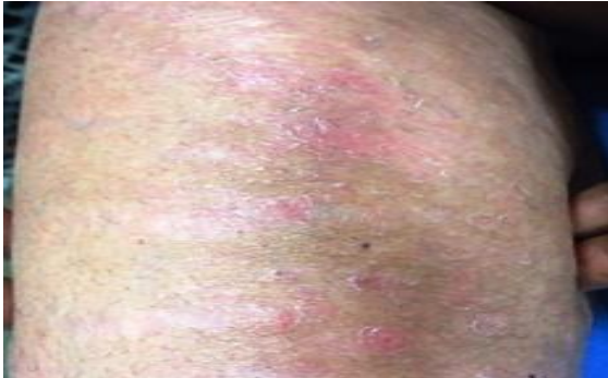
Figure 1. Clinical photograph of the thigh showing multiple erythematous annular plaques with polycyclic margins showing double-edge scales at the periphery. The skin appears dry and scaly with multiple pink to violaceous striae.