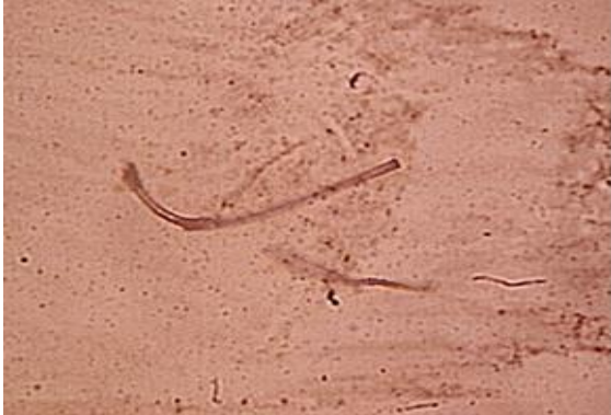
Figure 3. Light microscopy of the hair reveals acute angulation of hair over nodular thickening and the broken distal end in the scanning view giving an appearance of 'Bamboo hair'.