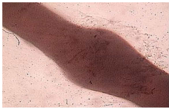
Figure 5. Light microscopy of the hair showing the invagination of the distal hair shaft into the proximal hair shaft in the form of 'Cup and ball' appearance in the high power.