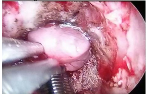
Figure 2. Armoured Tube in-situ