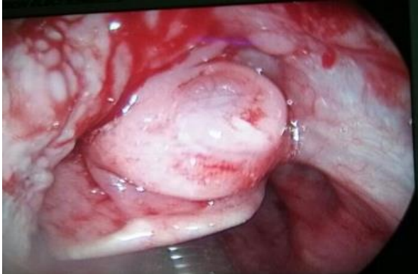
Figure 1. Epiglottis Cyst