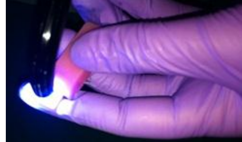
Figure 6. Light curing of composite resin placed over treated surfaces of acrylic resin denture tooth