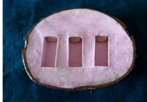
Figure 2. Teeth embedded in the plaster adjacent to mould space (after dewaxing)