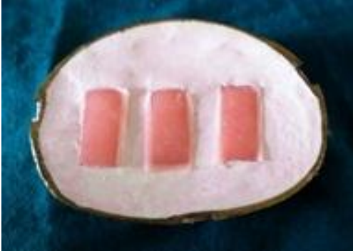
Figure 3. Packing of heat-cure acrylic resin material