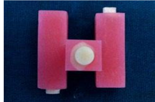
Figure 4. Acrylic resin denture tooth milled to a diameter of 6mm