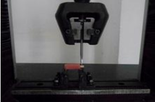
Figure 7. Test specimens in Universal Testing Machine