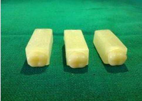
Figure 1. Wax blocks with mounted acrylic resin denture teeth.