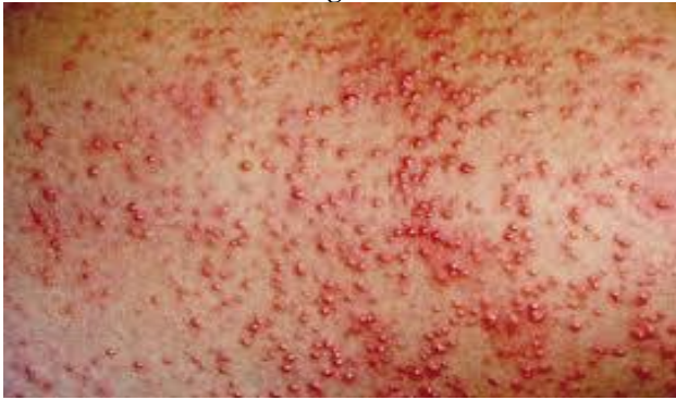
Figure 1. Erythematous rash over the back and loin region