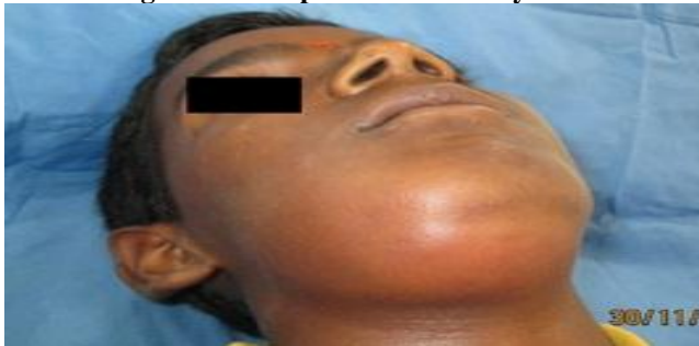
Figure 1. Pre operative worms eye view