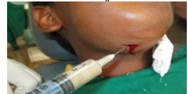
Figure 5. Aspirate for Culture and Antibiotic Sensitivity Testing