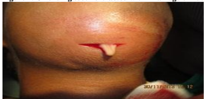
Figure 4. Offending tooth extracted with Drainage of Pus