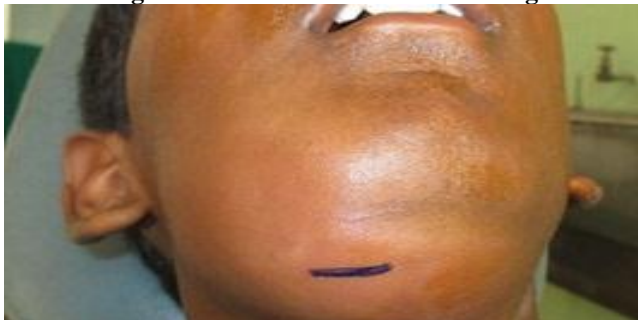
Figure 3. Incision marked for drainage