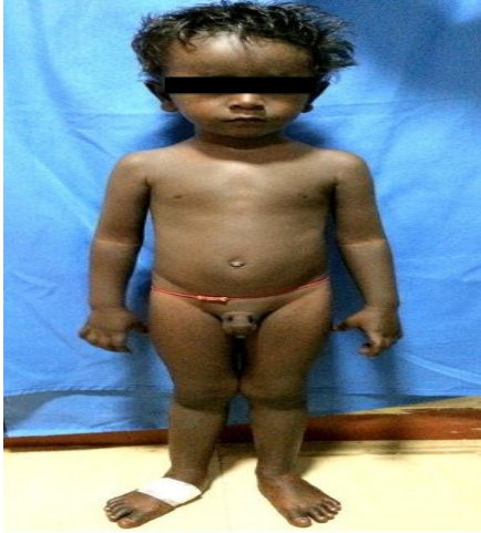
Figure 1. Generalized reticulate pigmented patches interspersed with numerous hypo pigmented macules involving scalp, face, earlobes, upper limbs, palms, trunk, genitalia, lower limbs, and soles.