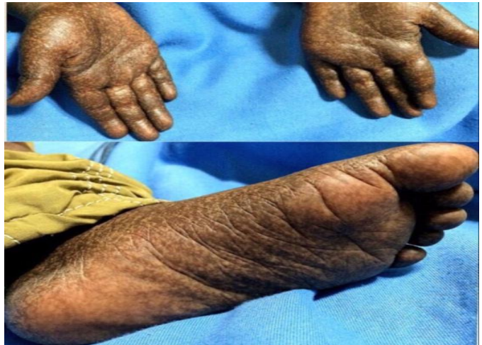
Figure 2. Clinical photograph showing lesions involving palms and soles