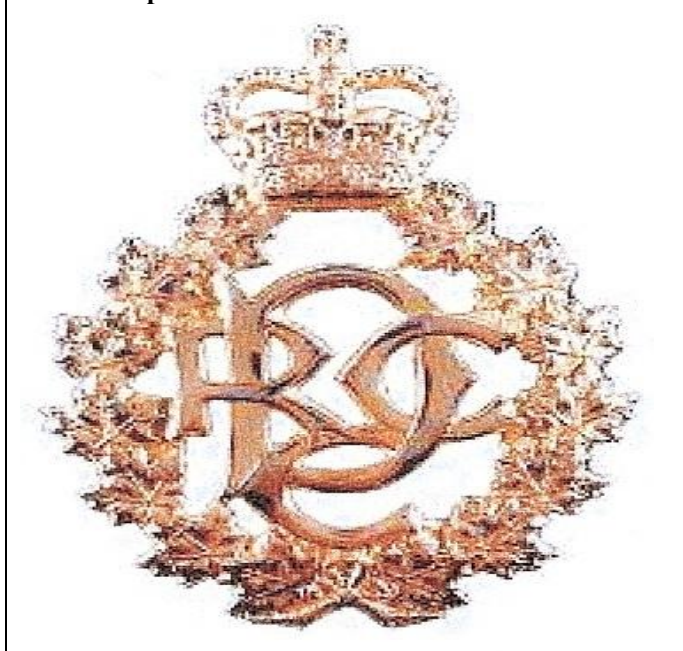
Figure 1. Distinguishing badge of the Royal Canadian Dental Corps from 1939 to 1947.