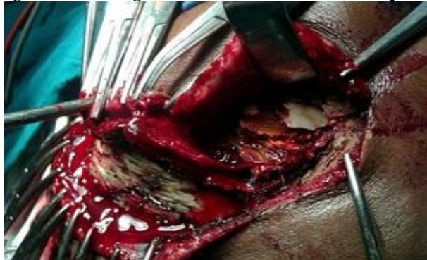
Figure 3. Showing retained intra cranial wooden pieces