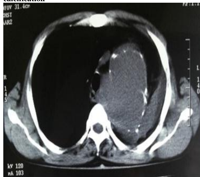
Fig 1. Non-contrast axial image shows abnormal aneurysmal dilatation of arch of aorta with peripheral calcification