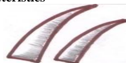
Figure 2. Trichomes in Bryonopsis laciniosa

The powdered seeds of Bryonopsis laciniosa have shown the presence of the trichomes.