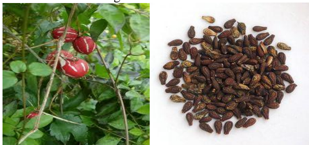
Leave, Friuts and Dried seeds of Bryonopsis laciniosa